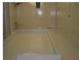
Chem-deck™ RA 800 Food Factory Floor