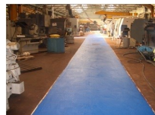
Fast-flor™ RS 800 Factory Floor