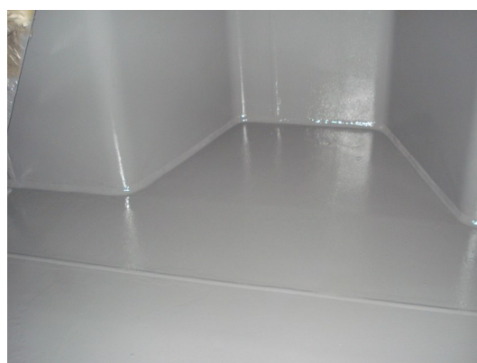
Epo-chem™ RW 500: Topcoat / Second Coat