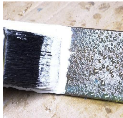
RL 500PF on a sweating, rusty surface